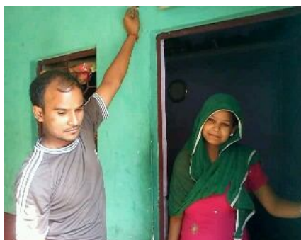
Figure 1: Residents of Khora Colony.

The was study conducted to understand the factors that affect the buying behavior of FMCG products for lower income group as such category of products touches everyone's life beyond income groups. An authorized colony, Khora was identified for the purpose. Khora falls under Ghaziabad Metropolitan Region in the state of Uttar Pradesh. The residents belong to lower income group and are primarily engaged in services as electricians, sweepers, cools, maids, gardeners, plumbers, security guards, masons etc. Figure 1 shows a resident family in the region. The sampling unit of 102 respondents was chosen on the basis of convenience sapling as if it is sufficient to have the findings "representative "of the population, then a non-probability sample can be selected (Schiffman and Kanuk, 2004). In order to arrive at better understanding of factors, a mixed method approach was used with explanatory design and sequential timing. The quantitative strand consisted of close ended questions and was analyzed using descriptive statistics. The qualitative strand consisted of open ended questions, designed to help explain the quantitative results, and analyzed by a coding system.