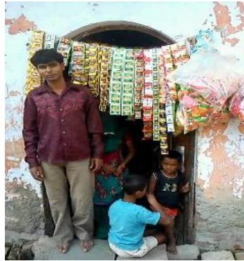
Figure 3: Local Grocery Shop in Khora.